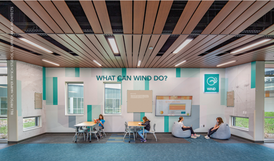
BILL FRITTSCH, HARPER FRITTSCH STUDIOS, COURTESY BRAY ARCHITECTS