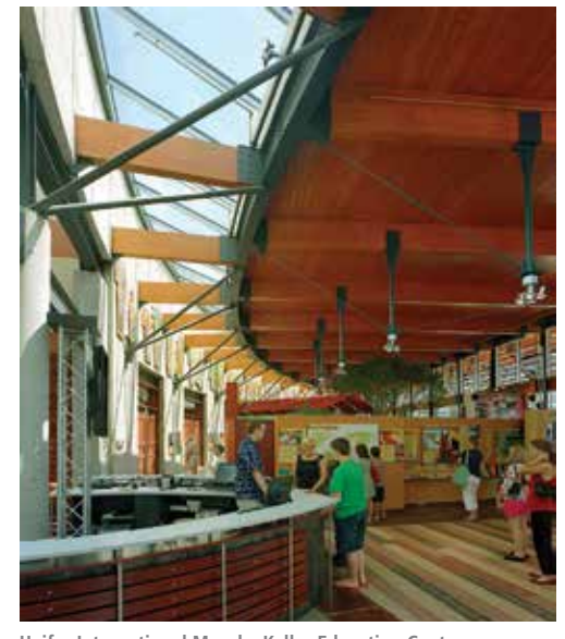
Heifer International Murphy Keller Education Center

Highlighting the thread of "honest structural expression" throughout these projects, the main anchor of the Heifer International Murphy Keller Education Center is a 2-foot-thick curved concrete wall, representing the barrier between industrialized nations and the world where the majority of humans live. Floating lightly from the wall, a timber roof, supported by glulam beams, is freed and separated by a continuous skylight, reflecting light onto the wall and exhibits. Maple-slatted walls hide air grilles, provide a means to hang exhibits and reduce sound reverberation. The exhibit space extends to a giant wood porch, where tree columns branch out, gently touching the pine roof canopy, extending the forest into the building form.