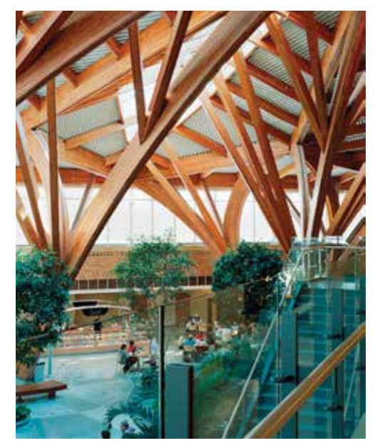
Credit Valley Hospital in Mississauga, Ontario, is one of an increasing number of healthcare facilities making use of exposed wood to create a warm, natural aesthetic that supports their healing objectives. Photo by Peter Sellar, Tye Farrow of Farrow Partnership, courtesy of naturallywood.com

use of wood—where 18 parallel strand lumber columns, each 45 to 63 feet tall, brace a tall glass façade against wind loads and carry roof loads (up to 400,000 pounds) from the steel roof trusses, some as long as 170 feet.