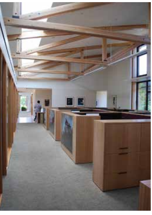
Occupants of the David & Lucile Packard Foundation headquarters are in constant contact with nature, indoors and out. Wood is the main exterior cladding material of the LEED Platinum building (left), and features prominently in the interiors (right), with extensive views of the outdoor courtyard.

The team also used stained poplar to warm and absorb sound in the lobby, which is big enough for 1,400 patrons from all three theaters to gather at the same time.