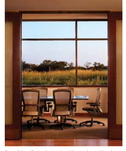
Research is confirming that interiors with natural materials and views, exemplified here in the Greater Texas Foundation in Bryan, Texas, can lower stress and promote relaxation.

Working with acoustics consultants Kirkegaard Associates, Kronberg Wall used wood for a majority of the reflective surfaces both to create the desired sound and warm aesthetic.