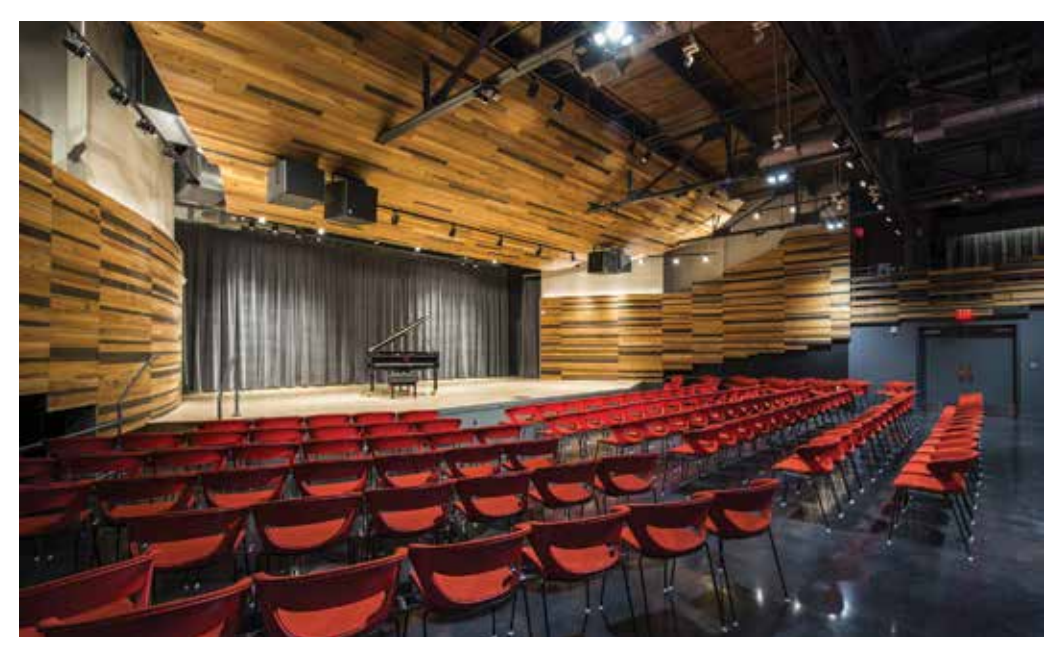
Peoples Health New Orleans Jazz Market | New Orleans, Louisiana | Kronberg Wall Architects

two apartment buildings, all of which include five stories of wood-frame construction over two stories of concrete. Designed by Mahlum Architects and winner of a WoodWorks Wood Design Award, the 668,800-square-foot project is the first of four phases planned to add muchneeded student housing to the urban campus.