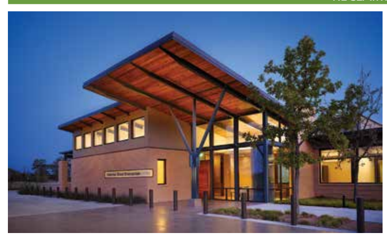
Greater Texas Foundation, Bryan, Texas.

In contrast to other materials, wood can typically be reclaimed and reused at the end of its service life, with only minor modifications and little waste. Reclaimed wood can be reused for its original purpose, for example as structural members, or remilled and fashioned into other products such as window and door frames, curtain wall components and cladding. Or it can be used for innovative new purposes, where it can bring not only enhanced sustainability, but a meaningful legacy for the people who use the new building.