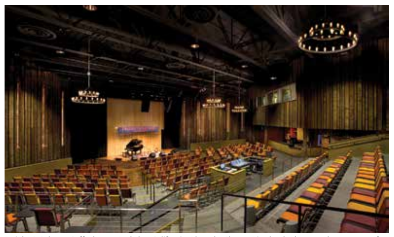
Freight & Salvage Coffeehouse, Berkeley, California.

The reclaimed wood was a favorite aspect of the building for almost everyone involved. "The client and team love how it looks, functions, sounds and feels as