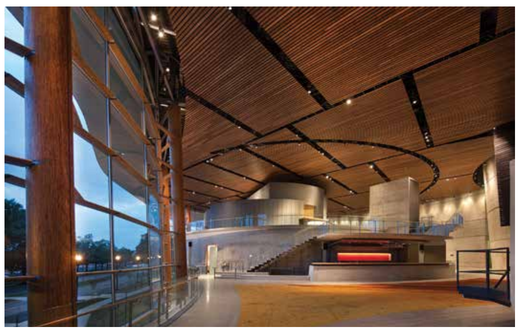
Arena Stage at the Mead Center for American Theater | Washington, D.C. | Bing Thom Architects

In 2012, the University of Washington in Seattle added nearly 1,700 student housing beds by constructing three residential halls and