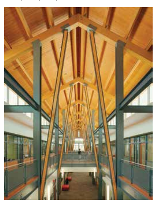
El Dorado Conference Center | El Dorado, Arkansas

However, while much has been written on the columns, wood was also chosen for its acoustic capabilities. A third theater, a smaller space referred to as the Cradle, posed a challenge due to the sound reflections caused by its oval shape. So the project team developed a wall