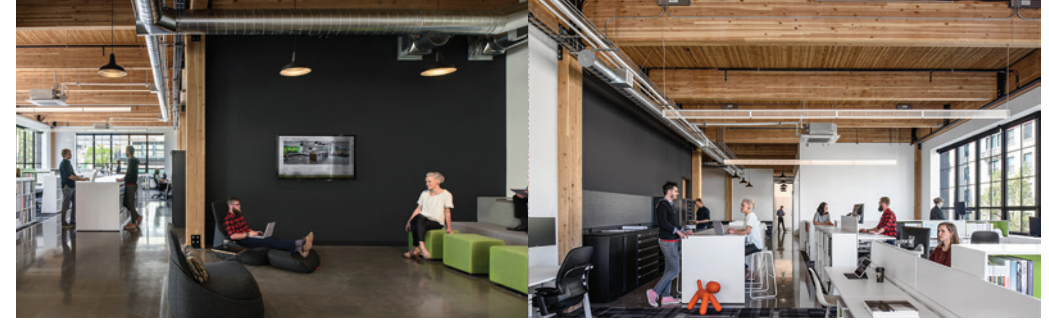
The Hudson | Architect: Mackenzie Architects

Wood can be an ideal choice in office environments because it is not as acoustically lively as other surfaces and can offer acoustically absorptive qualities. Generally, a wood-finished building is not as noisy as a complete steel or concrete structure. (Building Green with Wood Toolkit, Acoustics). As home to Mackenzie's Vancouver Washington office, The Hudson serves as an example of the firm's emphasis on employee well-being.