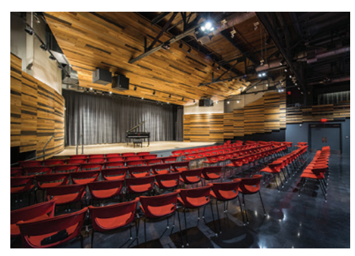
Peoples Health New Orleans Jazz Market | Architect: Kronberg Wall Architects

For Atlanta-based Kronberg Wall Architects, one of the greatest challenges in designing this 14,000-square-foot contemporary jazz performance space was acoustics. Located in an historic building in the birthplace of jazz—and home to the New Orleans Jazz Orchestra—the acoustics needed to add vibrancy and energy to the music being performed.