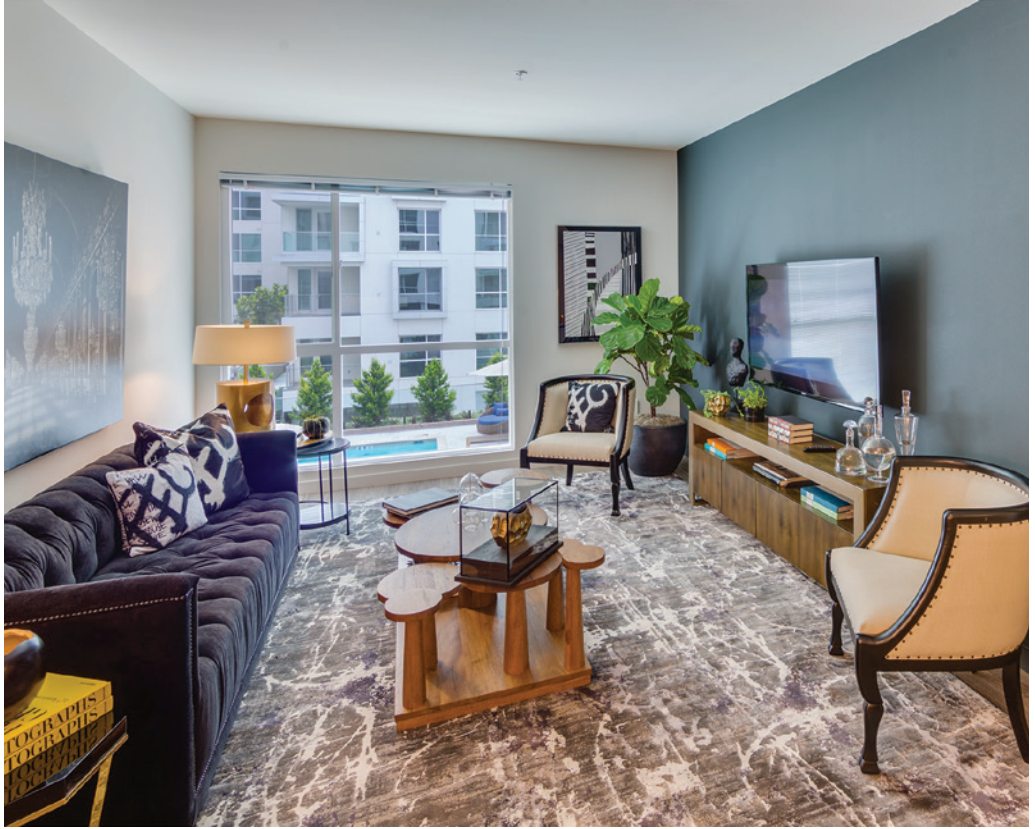
WREN is a wood-frame, 6-building, 7 story development in LA's South Park community and is the city's first Type III double-podium design. Architect: Toqawa Smith Martin